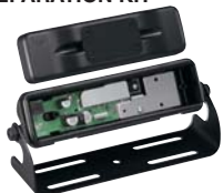
RMK-3 Use with one of the following separation cables.