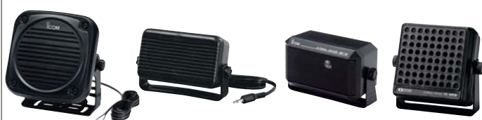
SP-30 30W max. input SP-22 SP-10 SP-5