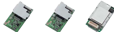
UT-109R Non-rolling type voice scrambler for analog mode UT-110R Rolling type voice scrambler for analog mode UT-126H IDAS NXDN digital unit

Icom, Icom Inc. and the Icom logo are registered trademarks of Icom Incorporated (Japan) in the United States, the United Kingdom, Germany, France, Spain, Russia, Japan and/or other countries. IDAS, IDAS logo are trademarks of Icom Incorporated. NXDN is a trademark of Icom Incorporated and JVC KENWOOD Corporation. LTR is a trademark of E.F. Johnson Company. All other trademarks are the properties of their respective holders.