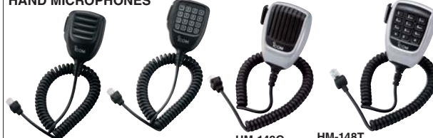
HM-152 HM-152T DTMF microphone HM-148G Heavy duty microphone HM-148T Heavy duty microphone with DTMF keypad