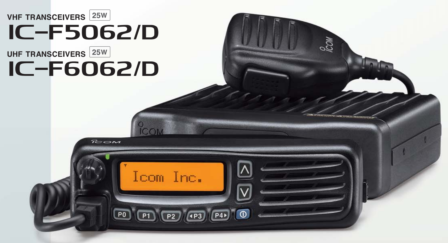
The above photo includes optional seperation kit, RMK-3, and separation cable, OPC-609.